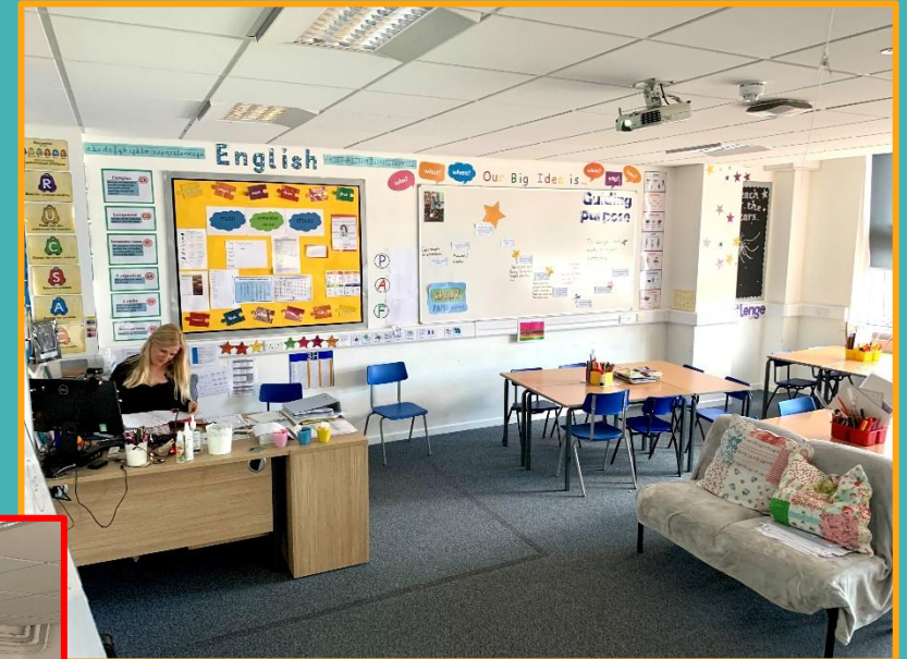
Our 3S Classroom